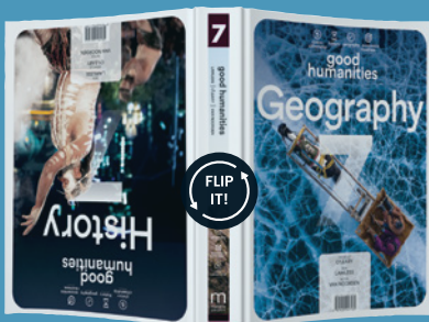
Year 7 Humanities