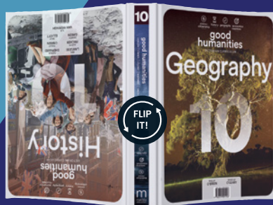
Year 10 Humanities