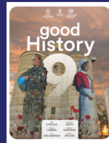
Good History 9