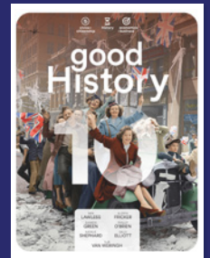
Good History 10