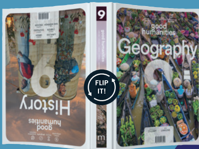
Year 9 Humanities