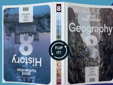
Year 8 Humanities