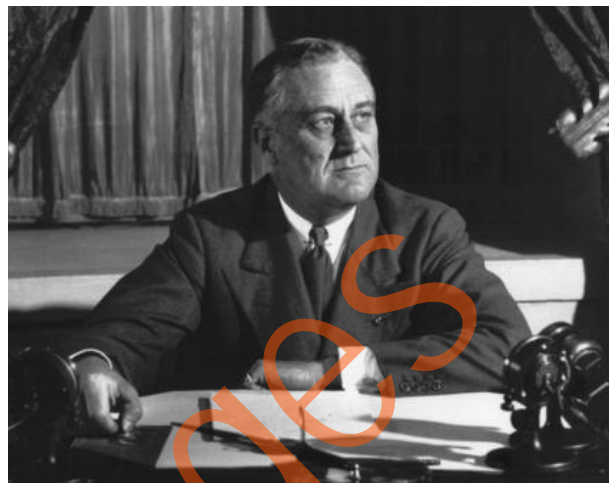
Above: US President Franklin D. Roosevelt.

The Allies adopted the Four Freedoms as they continued to fight in World War II.