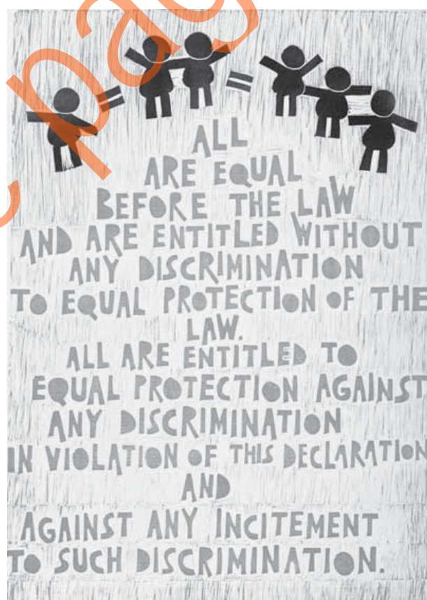
Above: Article 7 of the Universal Declaration of Human Rights. Artwork by Octavio Roth.

These rights apply to everyone, regardless of race, religion, nationality, gender or sexuality – this is why they are 'universal.' However, even for countries that are signatories of the UDHR, it is still the responsibility of governments to ensure these rights are enshrined in domestic law. It is also the responsibility of each country to ensure citizens have the freedom and opportunity to call their government to account should they fail to protect their rights.