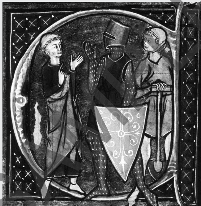
Medieval artwork showing 'those who prayed, those who fought and those who worked.'