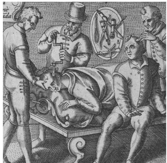
A depiction of 'trepanning,' a treatment for headaches in the Middle Ages

Life expectancy in medieval Europe was low, especially for peasants. Using the information provided on page 11 and your research, decide on four key changes a medieval peasant would need to make to increase his or her life expectancy. Explain each of your choices.